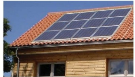
working on pioneering eco builds