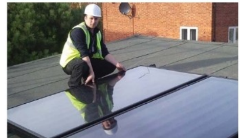
delivering award-winning projects