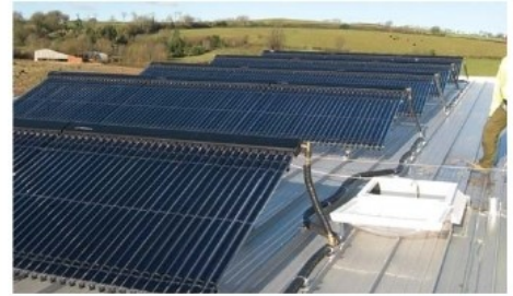
designing innovative solar solutions